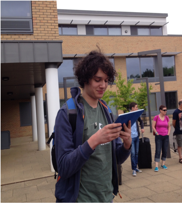
Last-minute Afrikaans revision