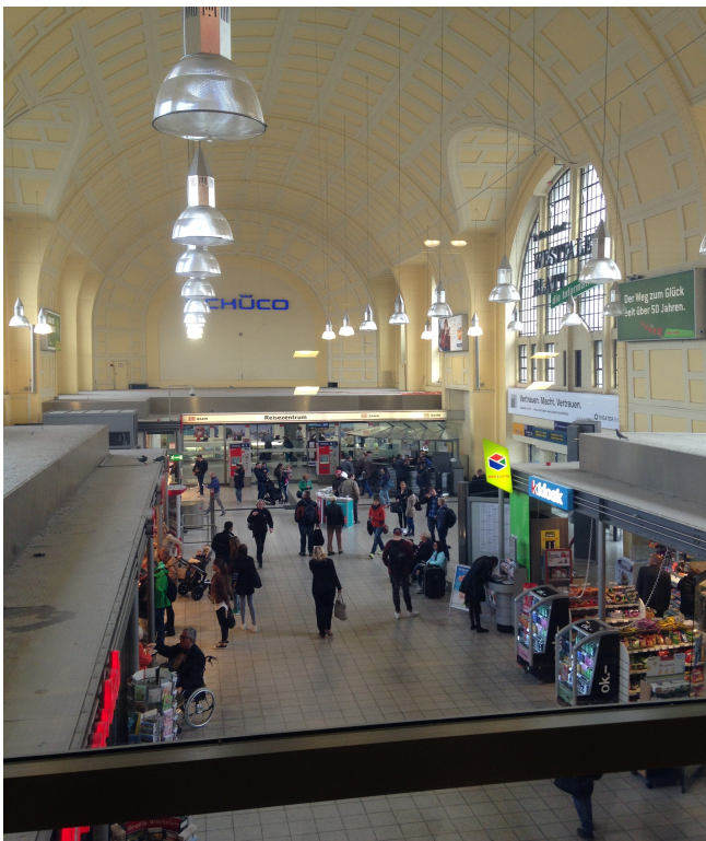
The exciting railway station at Bielefeld