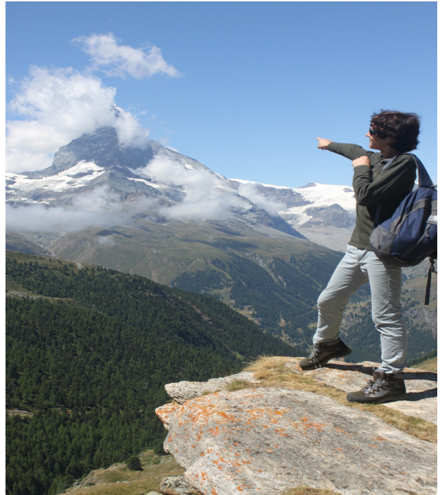
A famous icon, and the Matterhorn